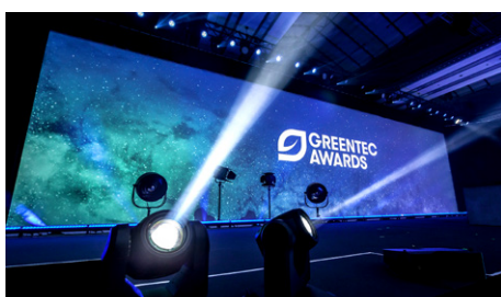
GreenTec Awards, partner since 2011, Munich, Berlin/Germany