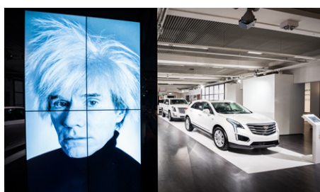
"Letters to Andy Warhol" Exhibition, Munich/Germany