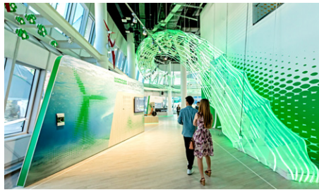
Energy Best Practice