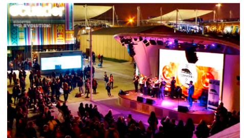
German Pavilion - Cultural Stage