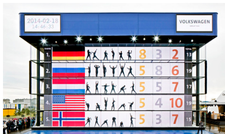
Volkswagen Pavilion, Sochi/Russia