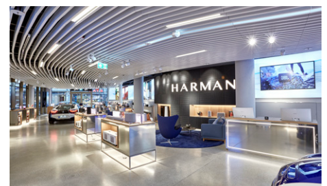
Experience Store, Harman, Munich/Germany