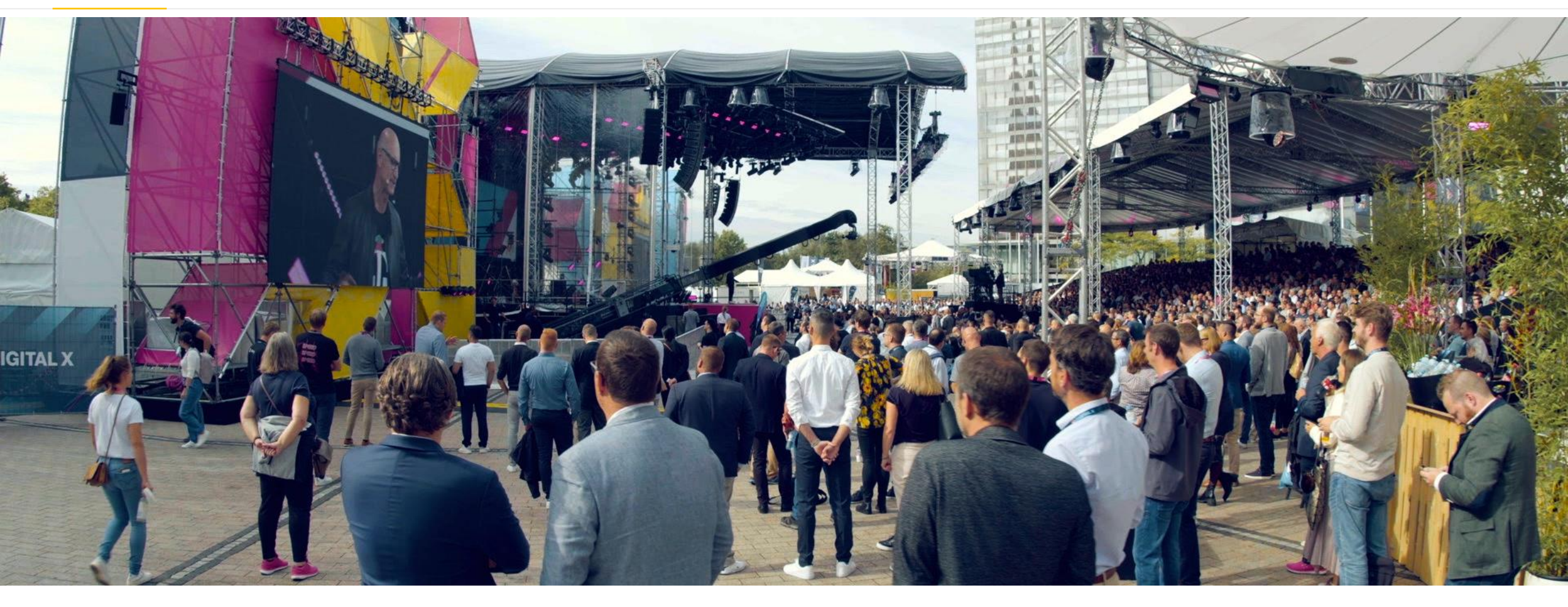
Digital X 2022, Cologne