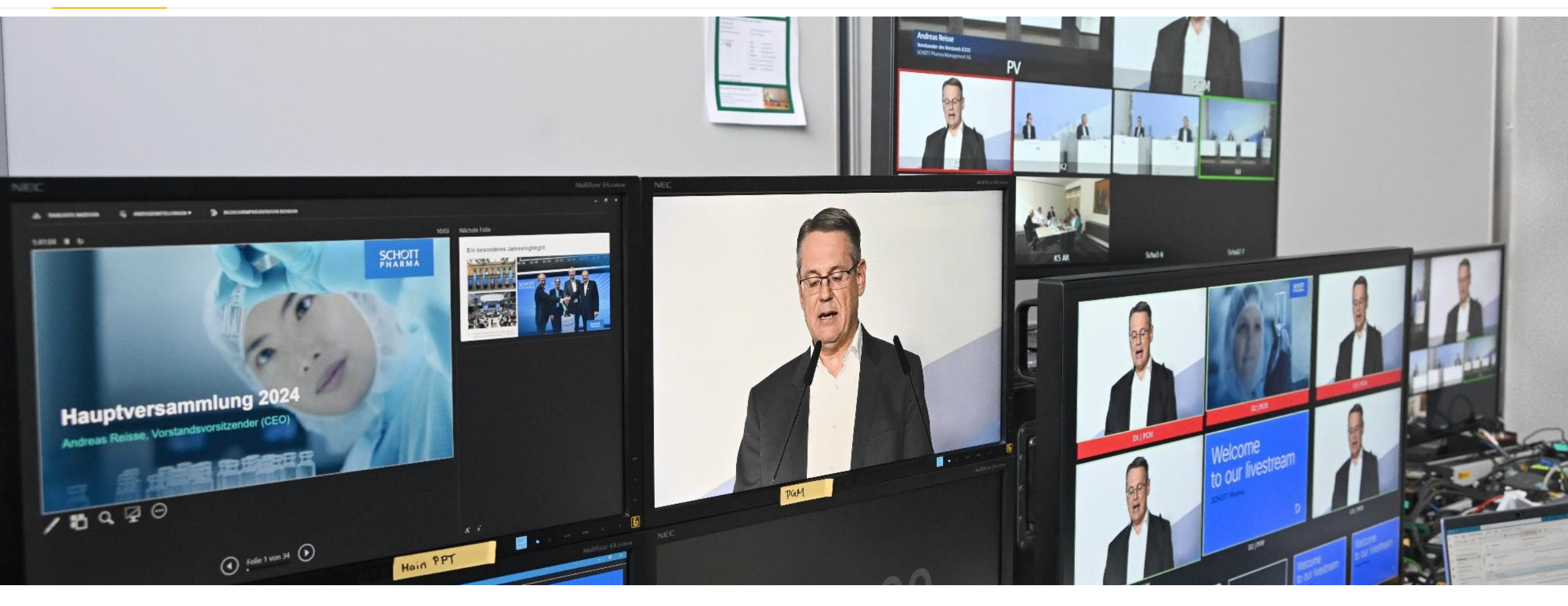
SCHOTT Pharma AG Annual General Meeting, Mainz